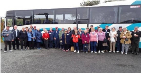
The bus trip, left, and the lake cruise to view the Maori carvings.