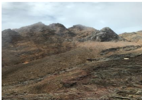
Left: The Pinnacles.