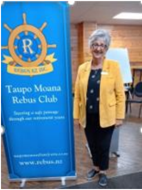
Our Host Club.