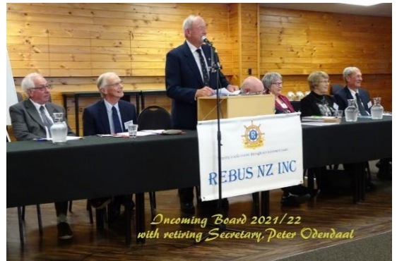
The New Board at the AGM.