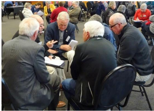
Thinking caps on at the Workshops.