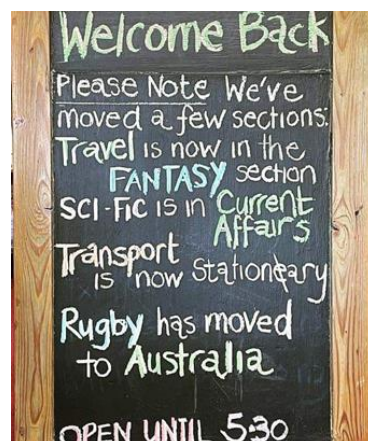
Palmerston North Bookshop