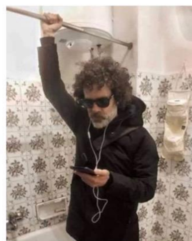
Working from home, but missing the train trips.