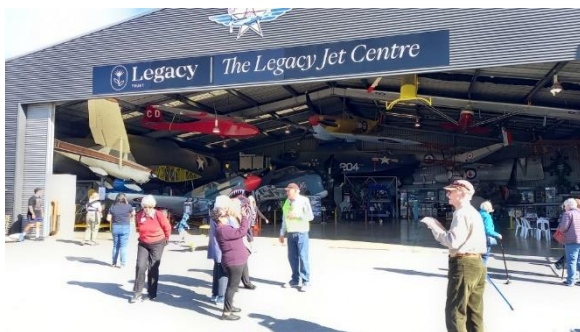
Left, visit to Classic Flyers Museum , and right, “The Elms” Historical Missionary House .