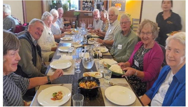
BANQUET AT THAI MARINA – 14 MARCH.