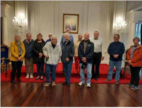
Photos: Recent visit to Government House.