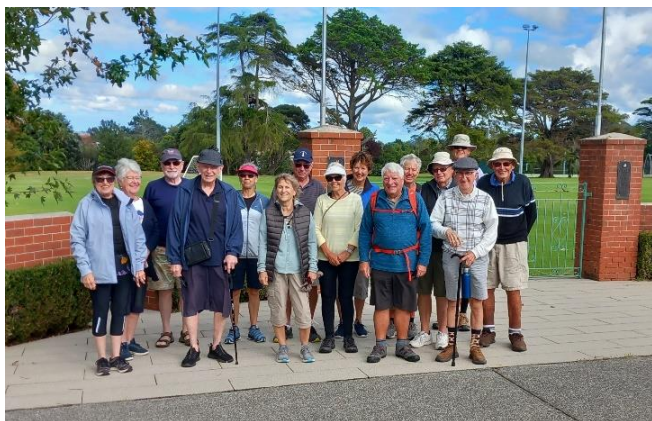
The Ramblers, 8 th April, Greenhithe.