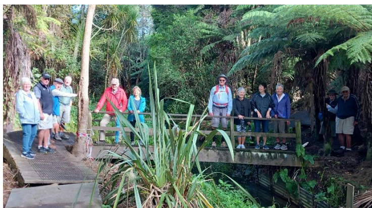
15 th April, Stanmore Bay.