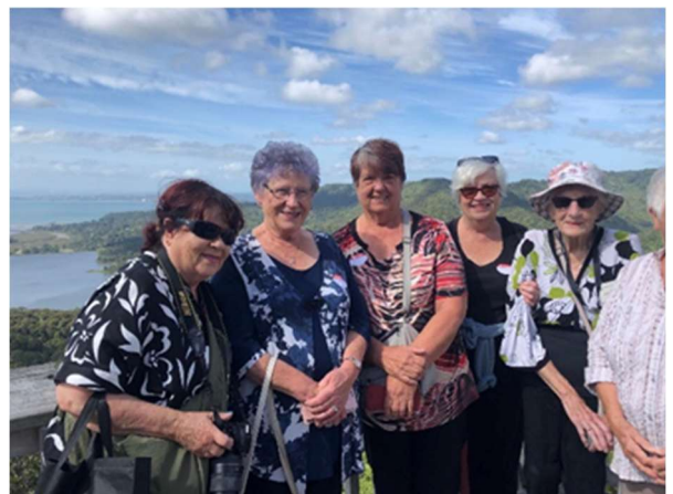
Right: Happy club day trippers enjoying the Arataki Visitors Centre Centre in Waitakere. The splendid weather provided spectacular

views across the ranges to the water catchment area and beyond.