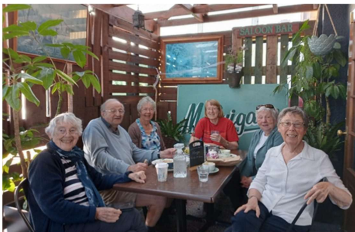
[Left] Coffee for the Walking Group at Boho Café. That's always a good time for a chat and we will continue to meet and stroll. Not only this month but April and beyond.