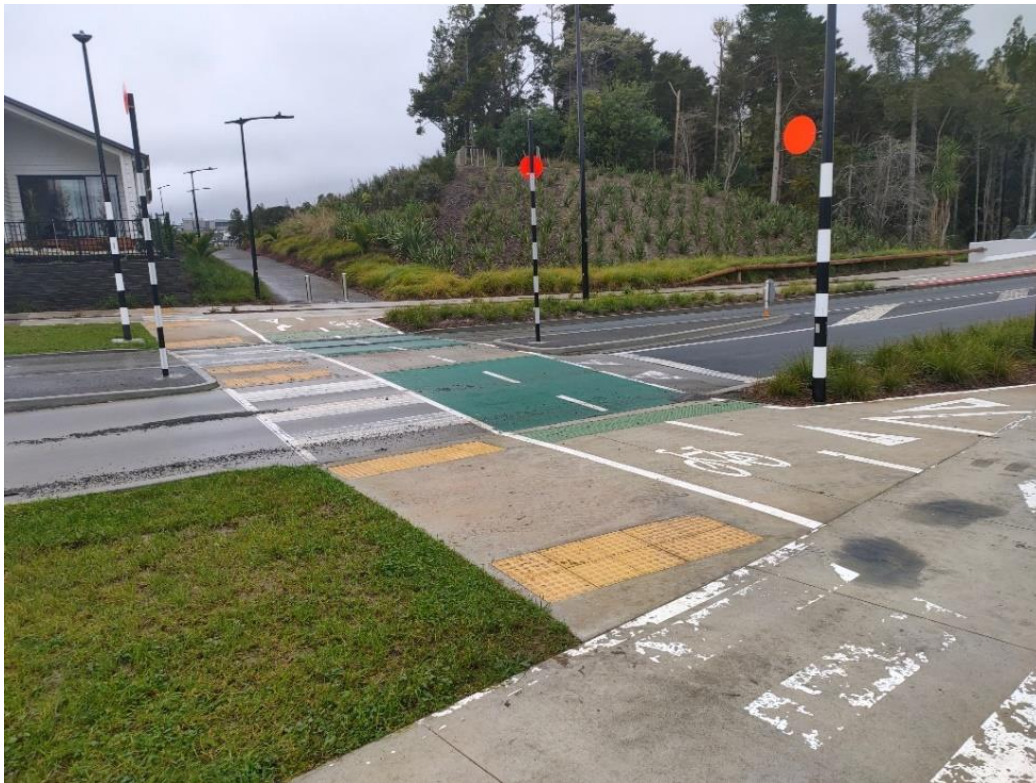
Milldale's boulevard of footpaths, cycle lanes and crossings, just no car parking.