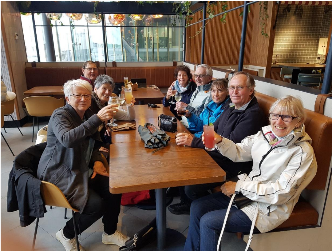
Some of the Ancient Greek Explorers waiting for their ferry home.