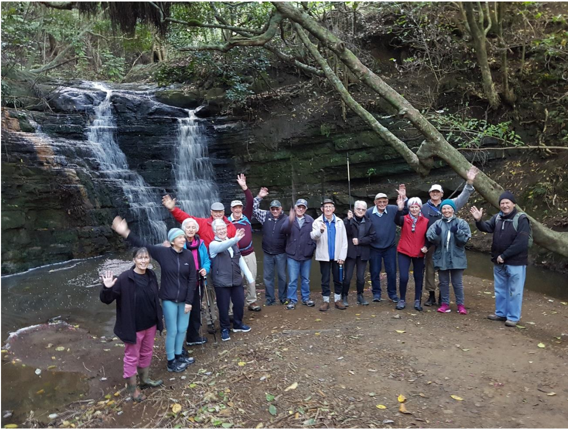
Shakespeare Regional Park Waterfall Ramble