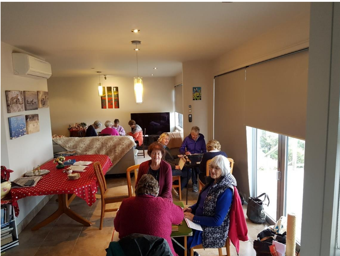
10 knowledgeable members plotting to win Mah Jong 27/07/22