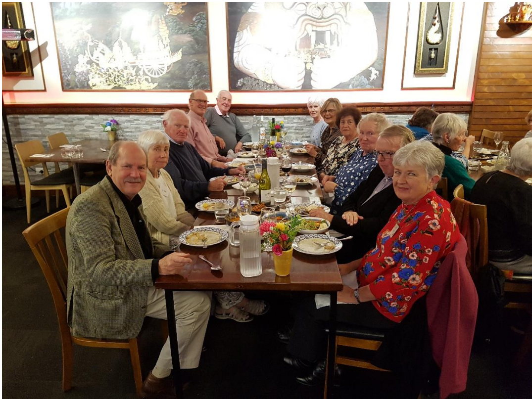
3 tables full of happy contented diners at Maison Thai