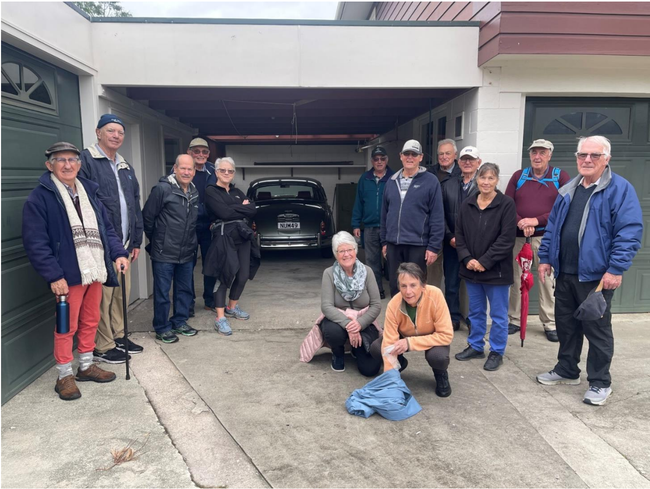
4 Beaches ramble 18/07/22