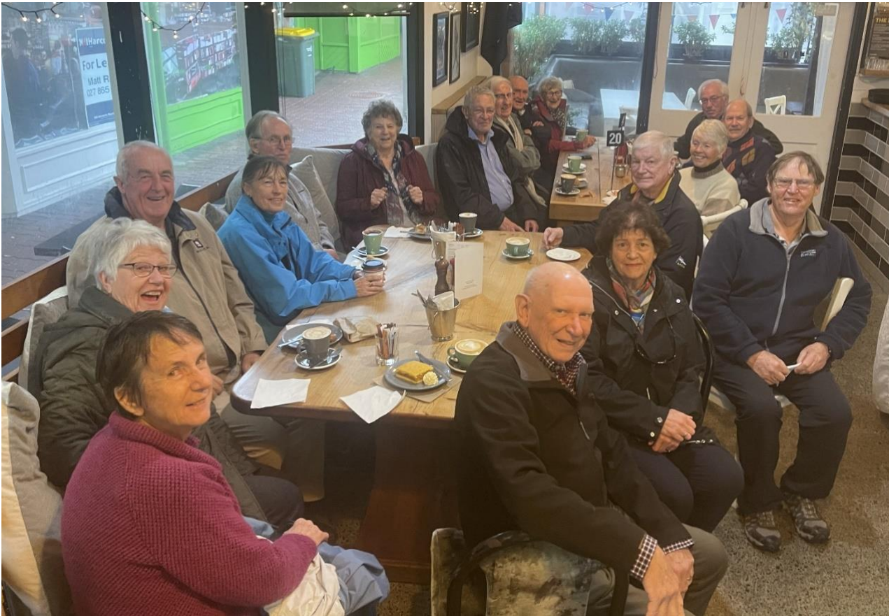
Happy dry ramblers at Bake n Brew Orewa 25/07/22