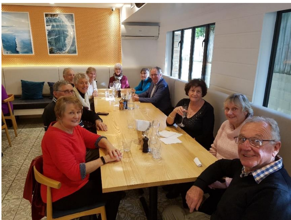
3 tables of contented club members socialising flatout.