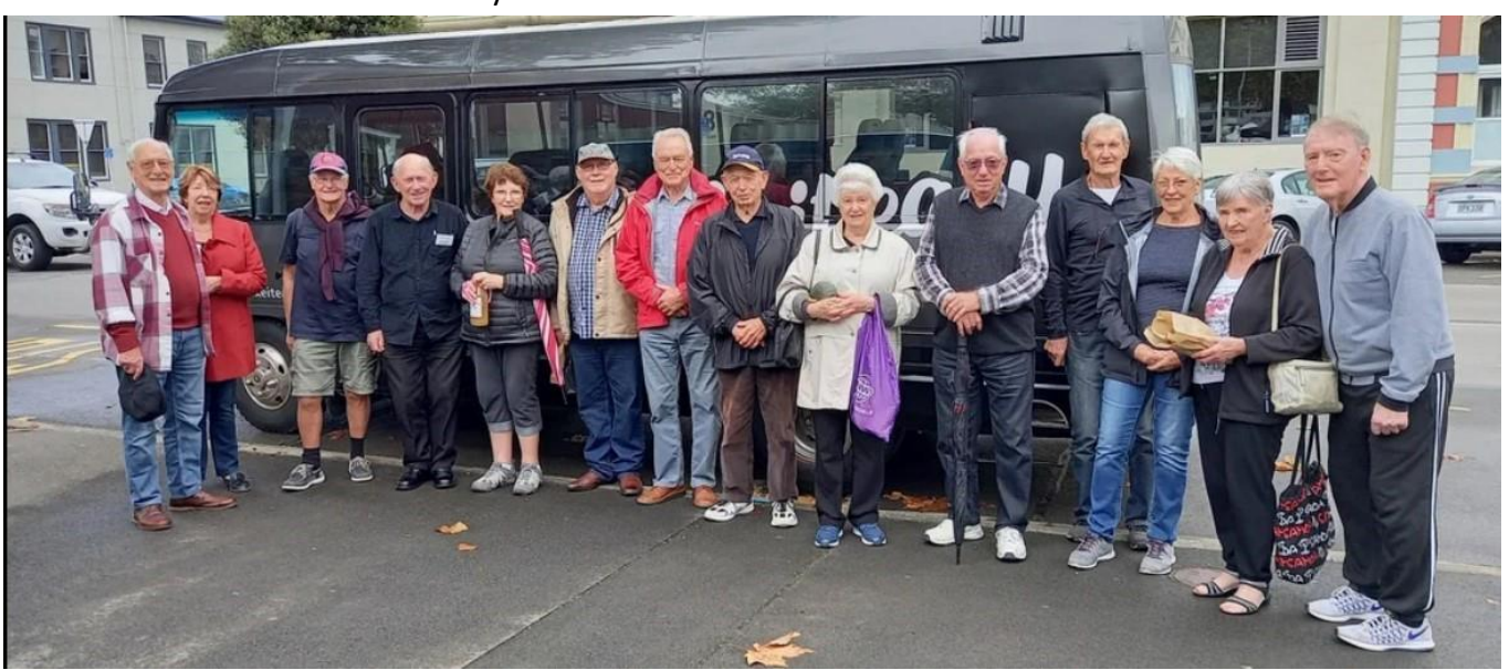
Saturday morning bus trip to the Markets.