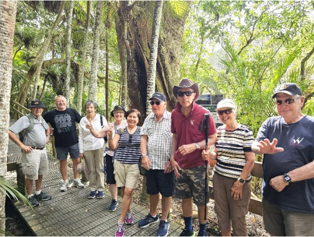
Ramblers, Alice Eaves Reserve, 30/12/24.