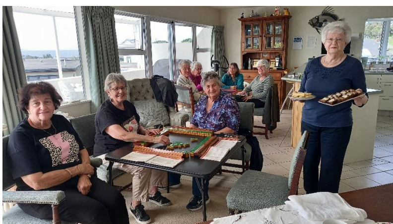
The Mah Jong Group continues to meet every Wednesday – afternoon tea included, as well as exercise for our brains!