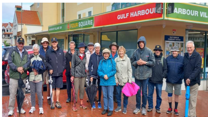
and 28 th October, Gulf Harbour Ramble.