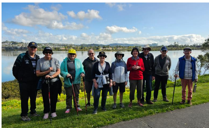
The Ramblers , 21 st October, Orewa Estuary,