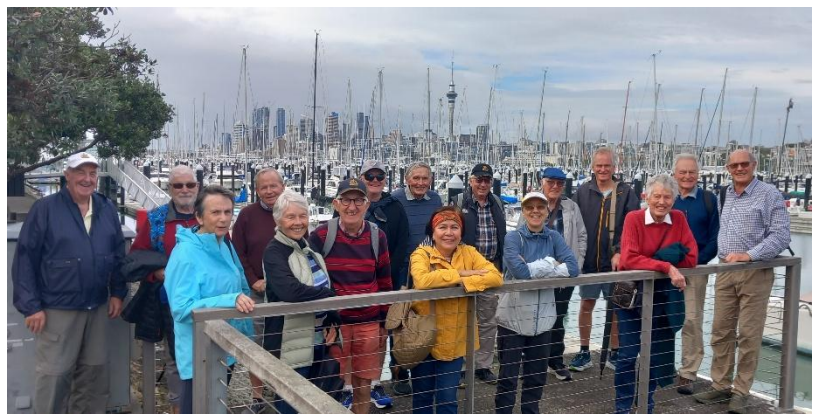
The Ramblers , 19 th May at Matakatia, and seagulling around at Westhaven on 26 th May, 2025.

NAME BADGES: Please remember to wear your name badge to all Club meetings, all trips, and events. We suggest you write the name and phone number of your “next of kin” (NOK) on the back of the name badge – just in case of an unexpected event etc.