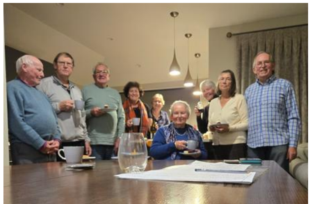
Ouch, the concentration at Mah Jong , 30 th July.