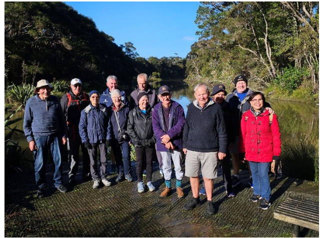
The Ramblers , left, Wenderholm ramble, 21st July, and right, Albany ramble, 14 th July.